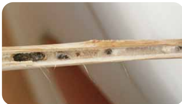
Figure 4. Sclerotia forming inside an infected canola stem

20% plants collected are infected with sclerotinia