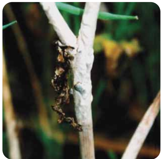
Figure 1. White fungal growth caused by Sclerotinia developing on infected stem tissue. Note the formation of sclerotes on the surface of the infected stem.

The disease spreads to the plant stems when infected flower petals fall and become lodged between the main stem and side branches accompanied by humid or wet weather. Initial symptoms are water soaked, light-brown discoloured patches (lesions) on stems or leaves that expand and become greyish-white (see Figure 2 over page). If a lesion completely girdles the main stem, the plant quickly wilts and dies. Infected canola plants will ripen earlier and stand out among green plants. The bleached stems tend to break and shred. In wet or humid weather, a white growth resembling cotton wool can develop on infected plant tissue (see Figure 1 below). Sclerotes develop inside stems and sometimes on the surface of infected tissue (see Figure 4 on back). The sclerotia may be later released onto the ground during harvesting or collected in the harvested seed. It appears that if the onset of the infection occurs late in the season, yields may be unaffected.