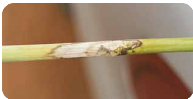
Figure 2. A typical sclerotinia stem rot stem lesion