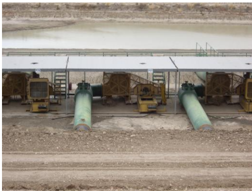
Some of the pumping equipment Cubbie