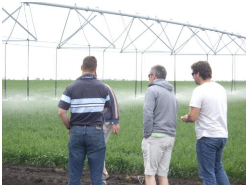
Precision Irrigation techniques Dalby