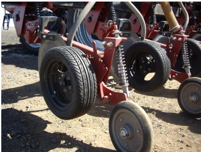
Disc seeder at Daybreak Equipment